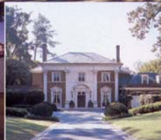
ATLANTA, GA $4,950,000 Harry Norman, Realtors ID: BHD8