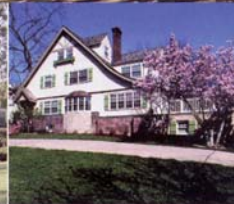
MISSION HILLS, KS $1,599,000 Reece & Nichols Realtors ID: XDE8

LUXURY PORTFOLIO™ FINE PROPERTY COLLECTION