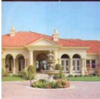
PLEASANTON, CA $4,595,000 Intero Real Estate ID: BTLB