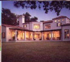
HOUSTON, TX $6,000,000 John Daugherty Realtors ID: DMM8